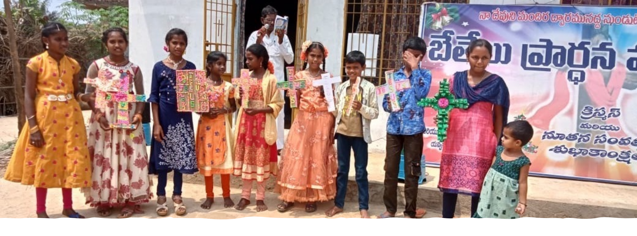
Sunday school children's ministry